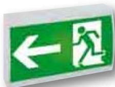
48011 1-3/D LED CGLine IP 41 with cover PL