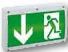
48011 1-3/D LED CGLine IP 54 with cover PU