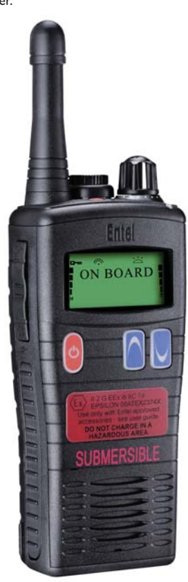
Pictured: UHF ATEX variant with stubby antenna