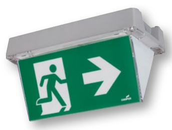
Atlantic LED D CG-S