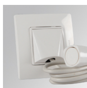
Product code: 8507810 Description: PUSH-BUTTON WITH CABLE