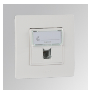
Product code: 8507920 Description: TELEPHONE OUTLET RJ-11