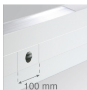
Product code: 8505160 Description: GAS COVER FOR 1 MEDICAL FLUID WHITE.