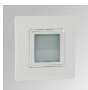
Product code: 8507900 Description: SURVEILLANCE LIGHT