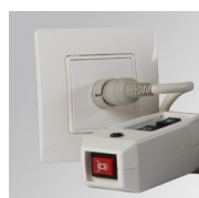
Product code: 8507820 Description: ACC. REMOTE CONTROL HOSPITAL