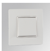
Product code: 8507840 Description: SINGLE-POLE SWITCH 8507860 TWO WAY SWITCH