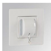
Product code: 8507890 Description: PUSH-BUTTON WITH CORD 8508890 PULL SWITCH CORD ACCESSORY