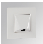
Product code: 8507910 Description: CABLE OUTLET FEETING