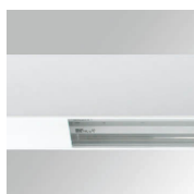
Product code: 8541010 Description: ACC. REFLECTOR DIR. CLINIC 1X14/24W