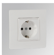
Product code: 8507880 Description: SCHUKO SOCKET OUTLET