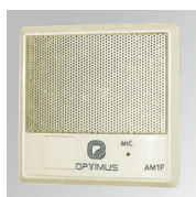
Product code: 8508097 Description: MICROPHONE AND SPEAKER