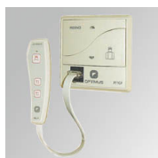
Product code: 8508117 Description: BUTTON + REMOTE CONTROL (CALL/PRESENCE)