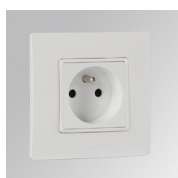
Product code: 8508880 Description: FRENCH SCHUCKO ACC.