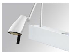
Product code: 8507800 Description: HOSP. EXPLORATION PROJ. E27 MAX 60W WH.